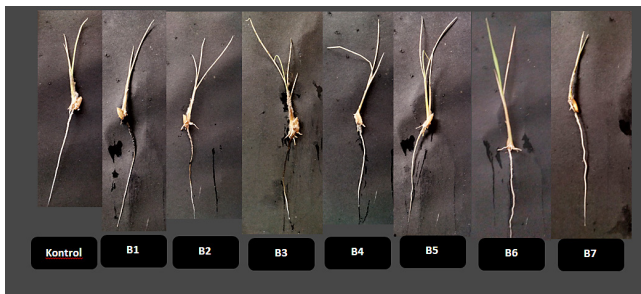
Fig. 2. The Effect of PSB isolates on the growth of rice seedlings at 21 days of age

The length of the plant roots will be more decisive in the absorption of nutrients than the weight of the roots. This is because long roots will be wider in the absorption of nutrients in the soil (Asova et al., 2018). The research of Fitriatin