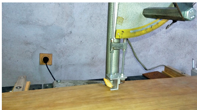
Fig. 1. Pendulum apparatus for determining the energy to detach the pod pedicels from chickpea stem

\Delta T_2 – the energy just to move the same pod, J.