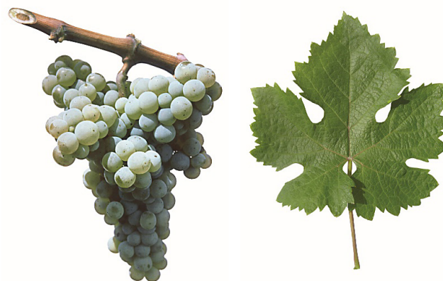
Fig. 1. Kokorko white wine variety (bunch and leaf)

Kokorko is a medium-ripening wine variety and the grapes matured in the second half of September. It has high fertility and medium yield. The vines are strongly growing. It is sensitive to mildew and powdery mildew and relatively resistant to low winter temperatures. The grapes are practically resistant to gray rot. The variety grows and has good yield grafted to Shasla x Berlandieri 41 B, Berlandieri x Riparia Cober 5 BB and Rupestris du Lot rootstocks. Guyot training is the most suitable for ground cultivation, however it also develops well in stem training, which significantly increases the yield (Getov et al., 2014; https://www.vinograd.info/sorta/vinnye/kokorko.html ).